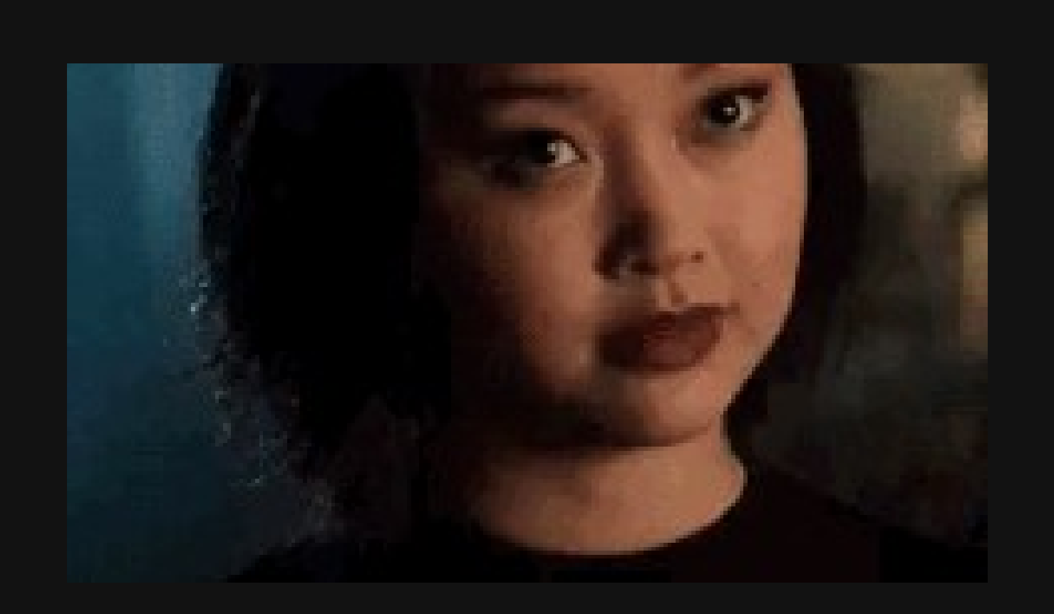
chapter five the art of secretly loving