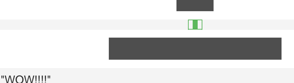
Chapter 55: I Think I Hit Too Hard