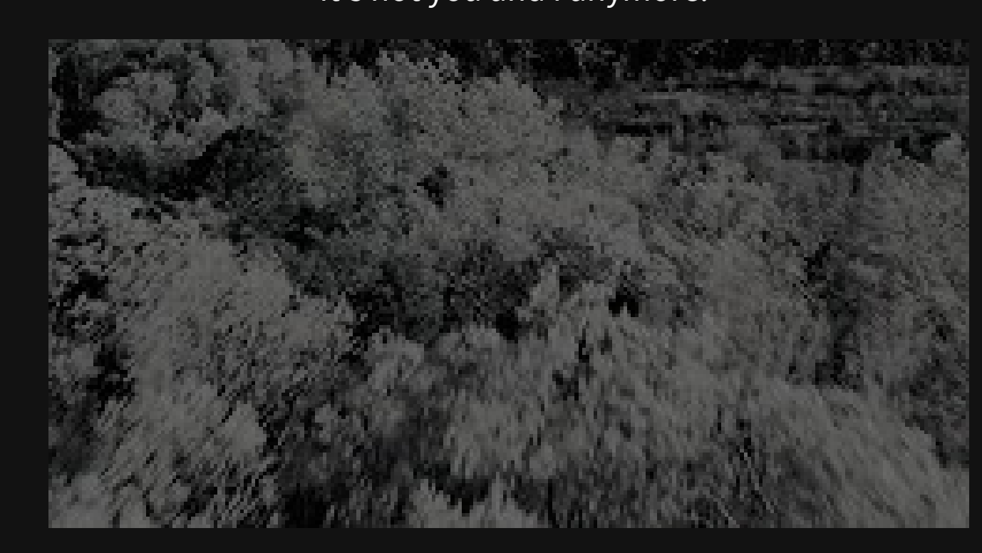
"It's you, and I. Separate, apart, distant. We were once apart of each other and now we're strangers,"

"Sometimes I think about the way we were and it makes me sick because it's not you and I anymore."