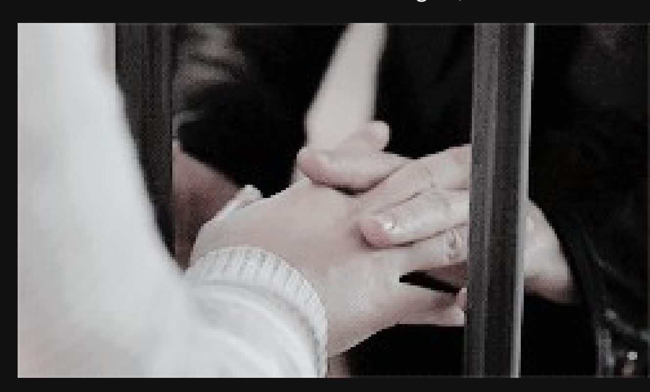
"back to square one. And I know things ended badly but I'd do it all again."