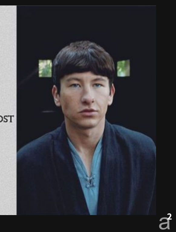
"I never minded being on my own then something broke in me and I wanted to go home."