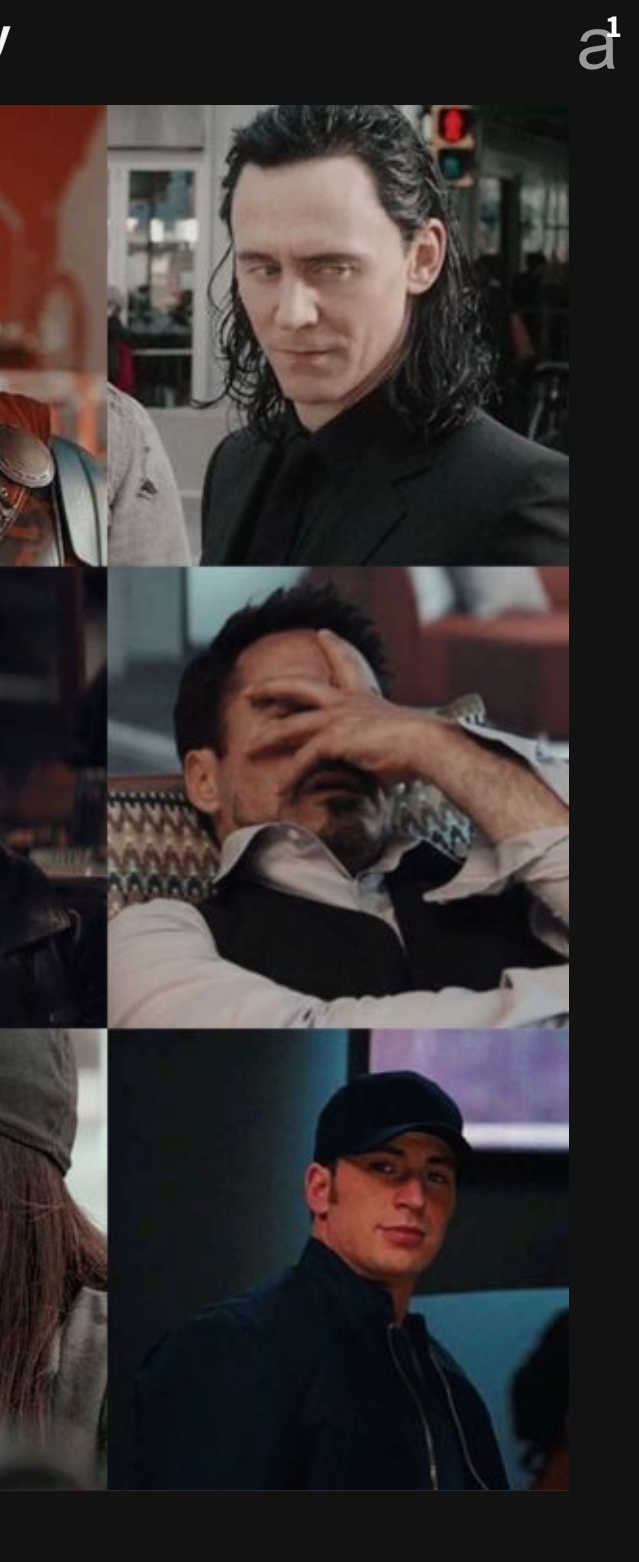
"I think I've seen this film before and I didn't like the ending." a