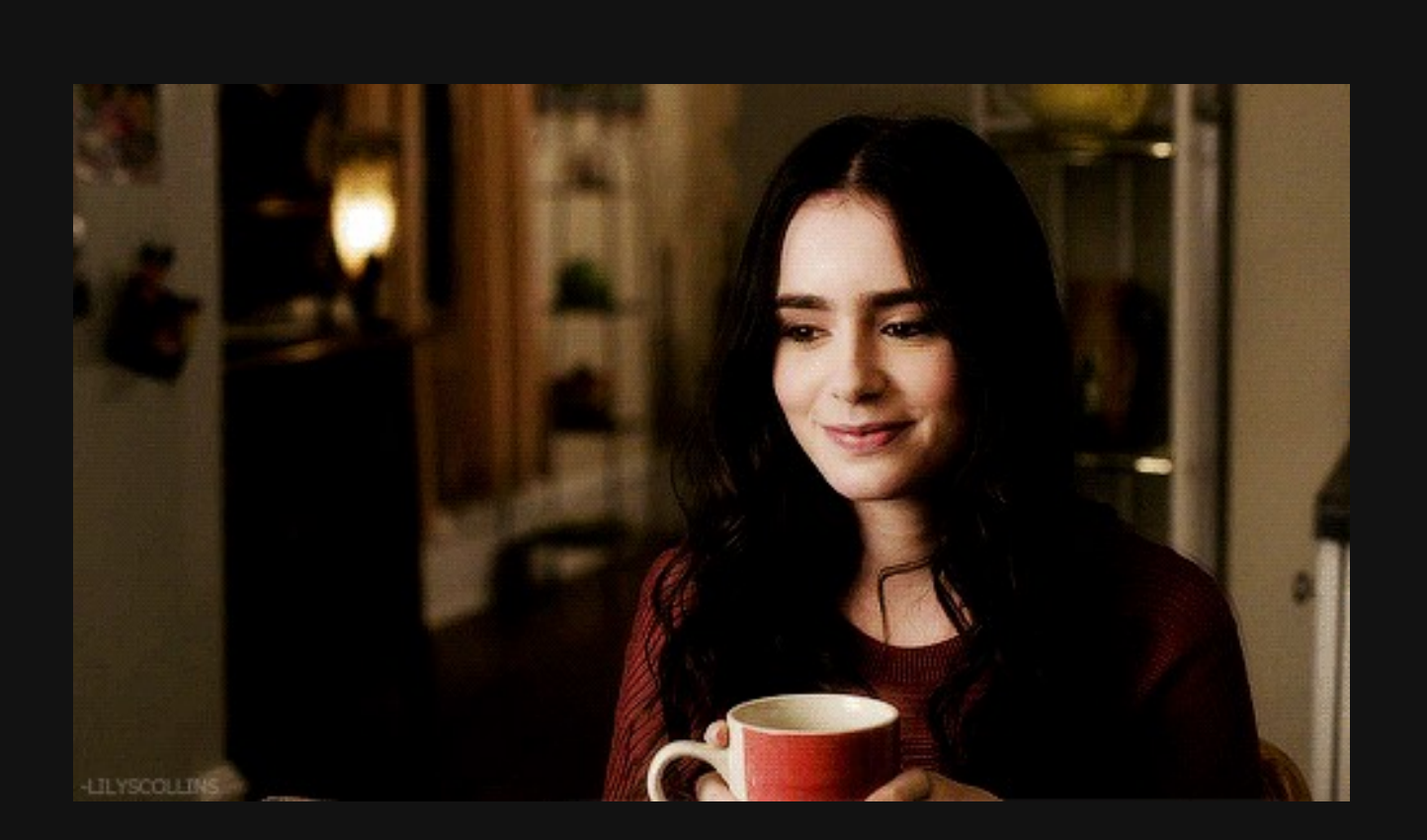
🔽 chapter ten, A STILLNESS 🖌