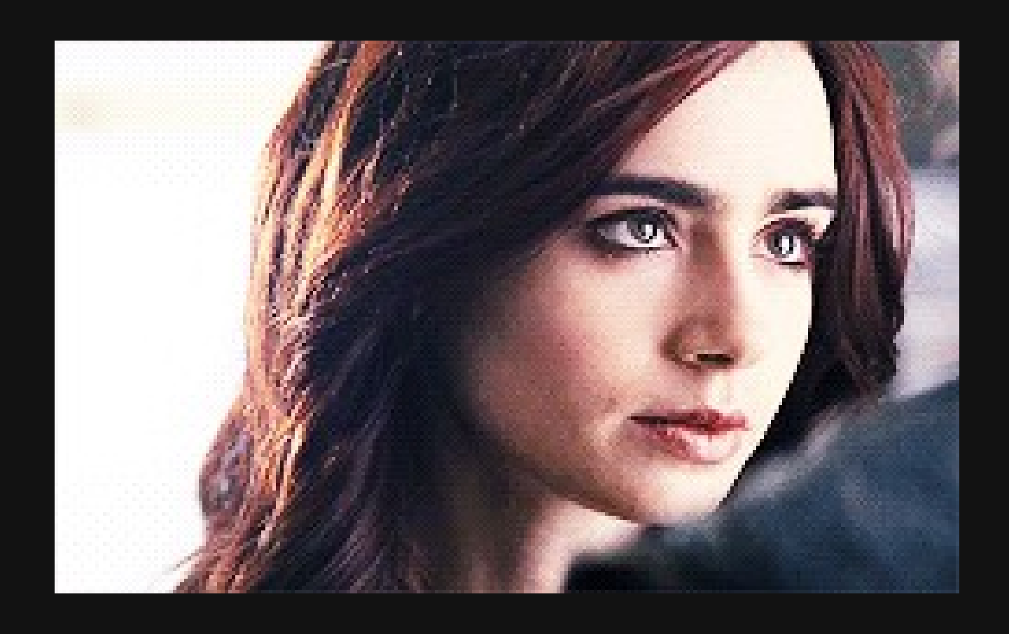
chapter eleven, GONE GIRL