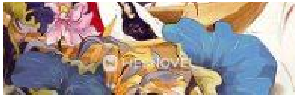
Source: <a href="https://boxnovel.com/novel/the-village-girl-who-jinxes-her-husband-is-filthy-rich">https://boxnovel.com/novel/the-village-girl-who-jinxes-her-husband-is-filthy-rich</a> <a href="https://boxnovel.com/novel/the-village-girl-who-jinxes-her-husband-is-filthy-rich">Generated by Lightnovel Crawler</a>